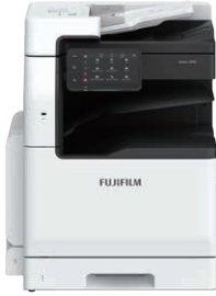
Standard Configuration 1 Tray

Standard Tray • 520 sheets capacity tray x 1-tray