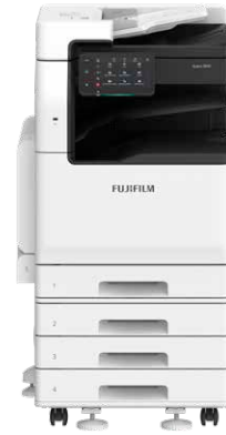
With 3 Tray Module

With 1 Tray Module • 520 sheets capacity tray x 2-tray