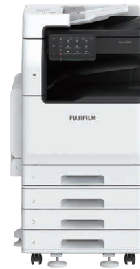
With 3 Tray Module

With 1 Tray Module • 520 sheets capacity tray x 2-tray